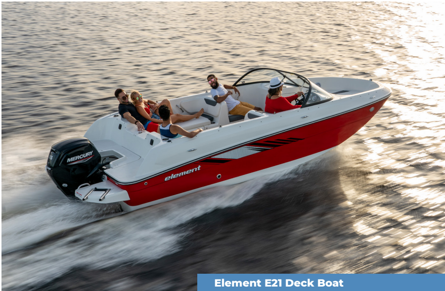
Element E21 Deck Boat