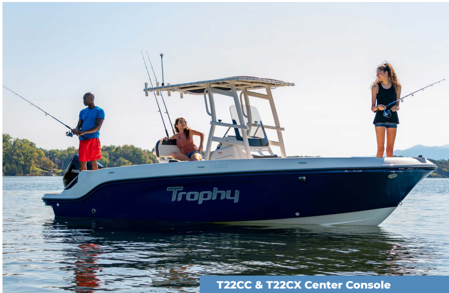
T22CC & T22CX Center Console