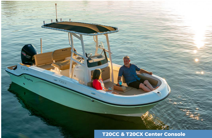
T20CC & T20CX Center Console