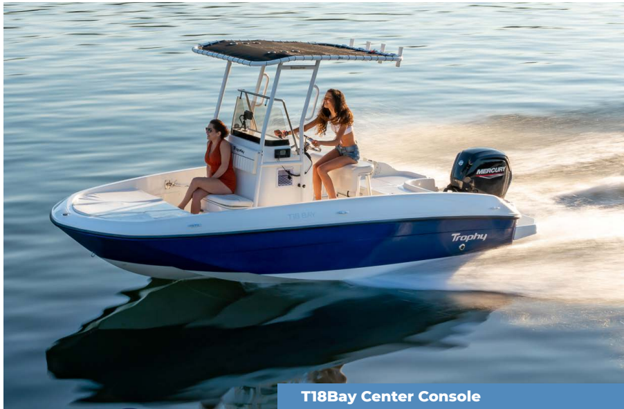
T18Bay Center Console