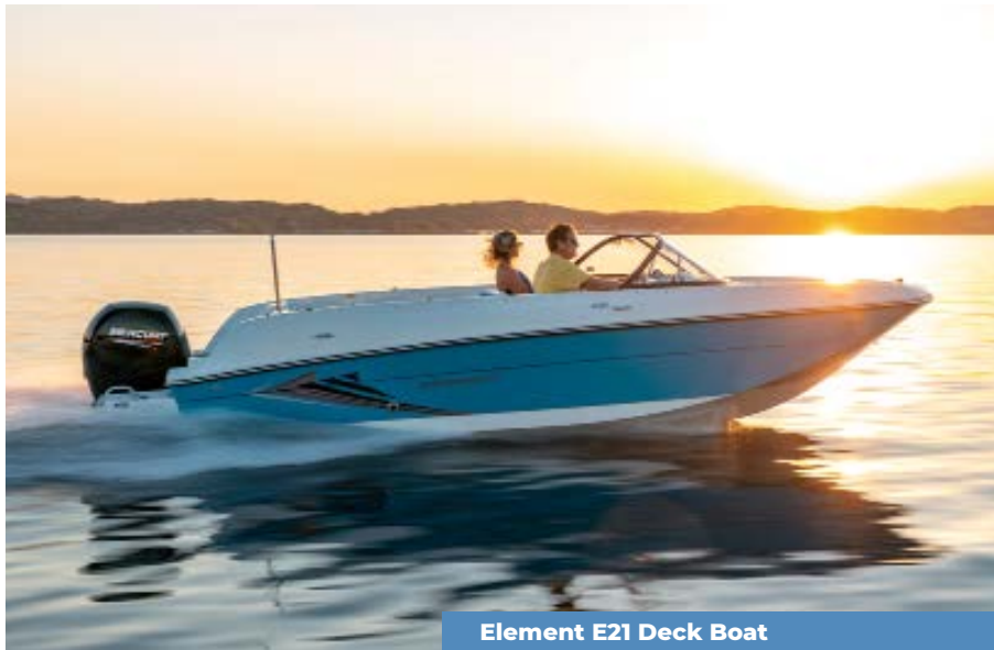
Element E21 Deck Boat