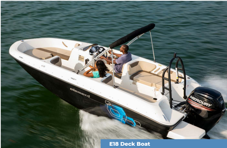
E18 Deck Boat