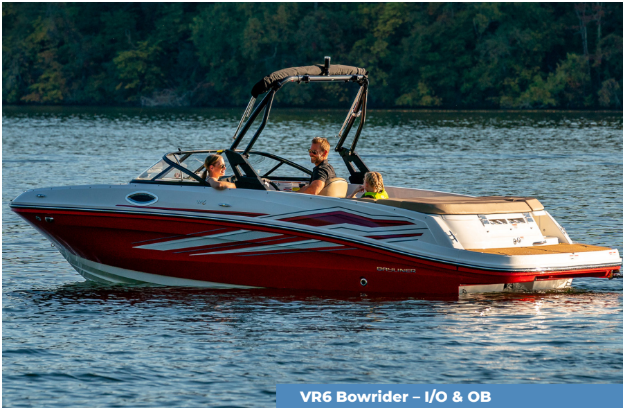
VR6 Bowrider – I/O & OB