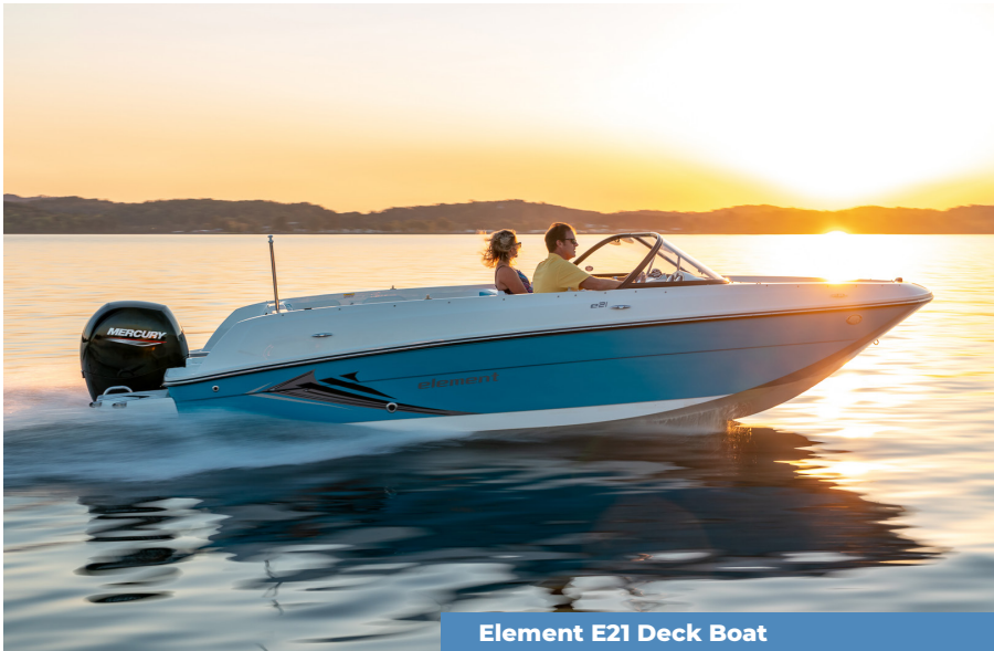
Element E21 Deck Boat